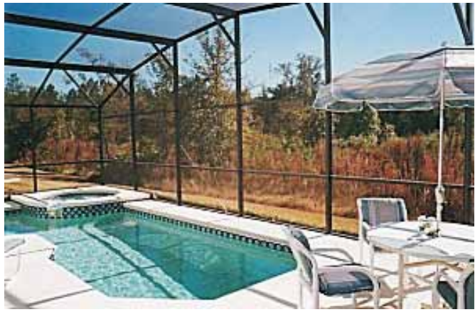
Four-Bedroom Executive Villa, sleeps 8 - 10 persons, built in November 2000

Enjoy the privacy of your own villa while on a holiday. Our villa is a four bedroom/two bathroom with private luxury pool and spa, sleeping up to 10 people. It includes a Roman-style master bedroom, a beach-style queen-size bedroom and two bedrooms with each two twin beds which are having a French and a Pelican accent, a family room with a view on the pool area and a living & dining room. The entire interior was decorated by us personally and is of a much higher standard than what you would usually find in a rental home