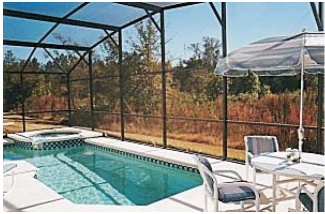
Four-Bedroom Executive Villa, sleeps 8 - 10 persons, built in November 2000

Enjoy the privacy of your own villa while on a holiday. Our villa is a four bedroom/two bathroom with private luxury pool and spa, sleeping up to 10 people. It includes a Roman-style master bedroom, a beach-style queen-size bedroom and two bedrooms with each two twin beds which are having a French and a Pelican accent, a family room with a view on the pool area and a living & dining room. The entire interior was decorated by us personally and is of a much higher standard than what you would usually find in a rental home